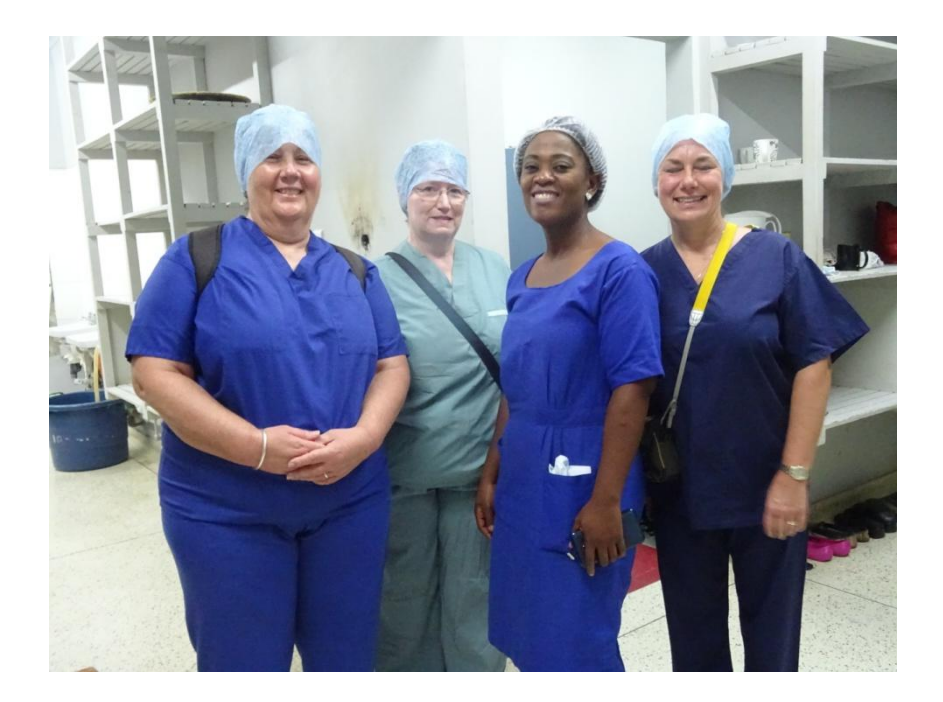
The FoAN team visiting Theatres before the Zambia Workshop